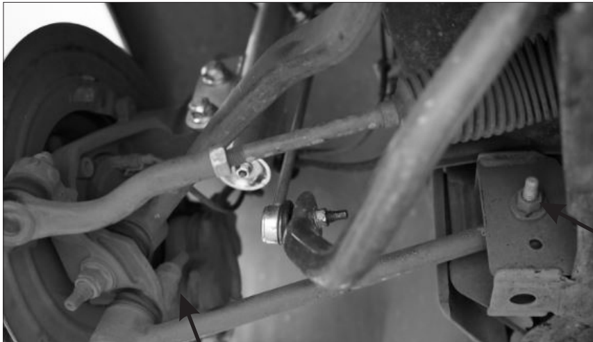
Ball joint nut

Contents - Bushing 91962 X2 - Steel tube 24X12.2X51 X2 - Grease