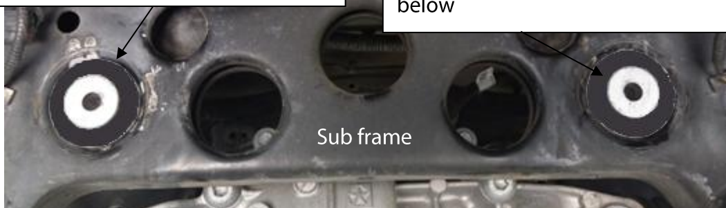
Above: View of installed rear bushes looking from the rear of the vehicle

Note: The black part of the bush should face the rear of the car as below