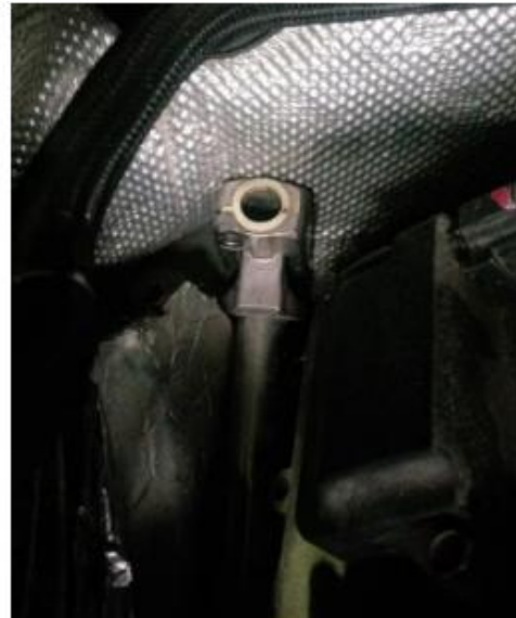
Figure 02 - Steering Shaft to Steering Rack Top Unit after

To remove the right hand control arm inner front nut, part of the inner guard clips (level with upper control arm) is to be removed. Thus, you can remove the control arm nut as the bolt similarly is fixed by locking tab.