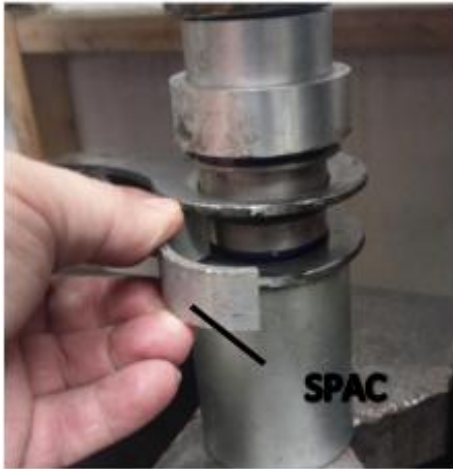
Figure 03 - Spacer utilised in installing '4944' bush