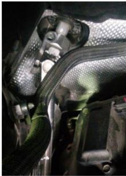
Figure 01 - Steering Shaft to Steering Rack Top Unit prior to

Subsequently, the right hand upper control arm inner bush rear nut can be removed after firstly loosening the steering shaft to steering rack top unit joint bolt. After sliding down the shaft, remove the fasteners holding the heat shield and thus remove the heat shield. (See Figure 01 and 02)