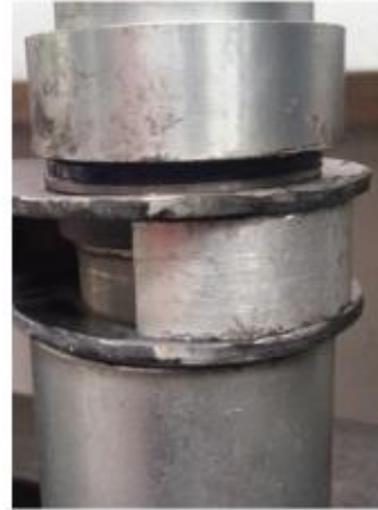
Figure 04 - Pressed '4944' bush