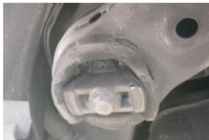
Figure 02 – Cradle Bolts to be loosened.