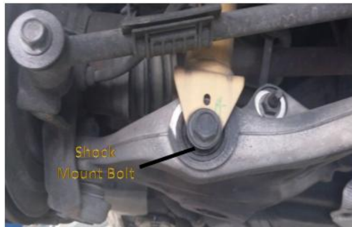
Figure 01 – Left Rear Lower Wishbone Control Arm