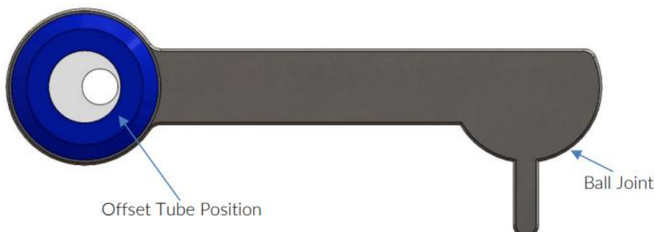
Figure 2: Offset Tube Position