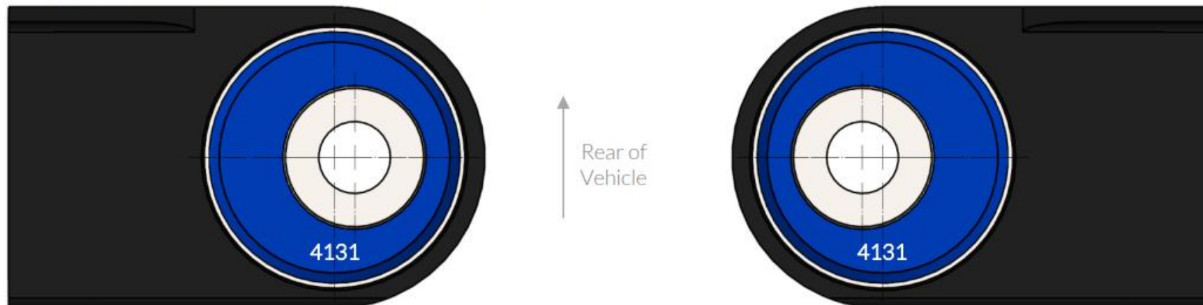
Figure 2: Toe Control Arms Inner Bushing (Front View)

This kit adds at least 5mm to the current toe measurement