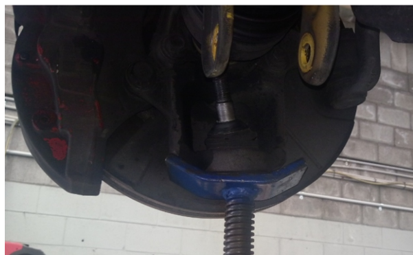
Figure 02 – Floor Stand with raised brake assembly.