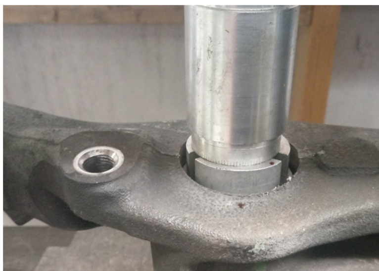
Figure 03 – Removal of OEM rubber shock eye bushing.

Note: These components must be fitted by a qualified person only, as per the manufacturers service manual. Also, that all relevant safety procedures are followed in addition to above.