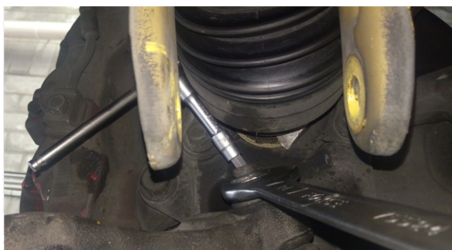
Figure 01 – Ball Joint Fastening Method.