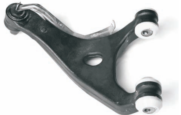
Fig 2 - left control arm with new bushes.