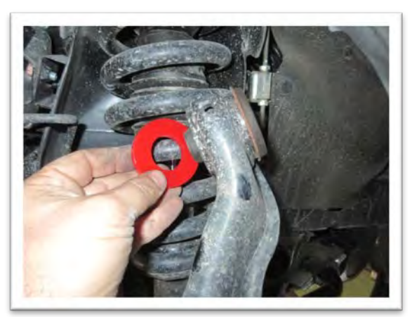
<u>Image 6 = 68629 bushing</u>