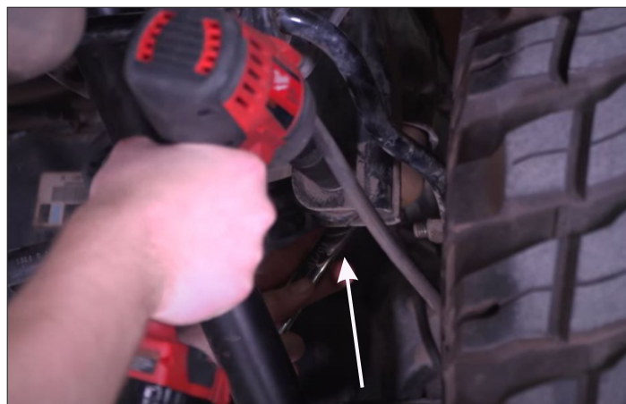
Upper chassis bolt