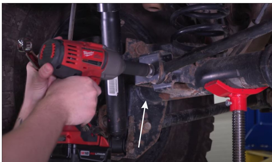
Lower Differential bolt