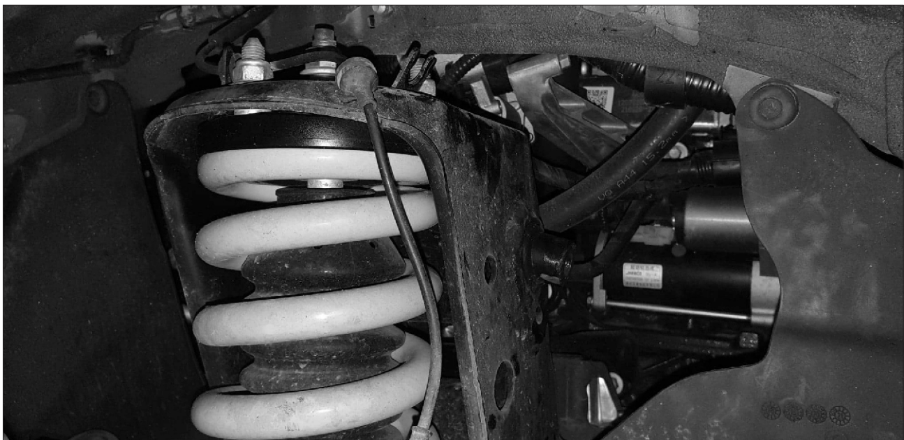
Arm removed from vehicle --- Refer Page 2 -

It is recommended that a licenced workshop or tradesperson carry out the above procedure and that workshop manual and relevant safety procedures are followed in addition to the above.