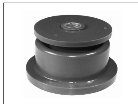
Thin Pad - on top

V6 VQ – VT Commodore fit the THIN PAD V8 VQ – VT Commodore fit the THICK PAD V6 & V8 VX – VZ Commodore fit the THICK PAD All model Monaros fit the THICK PAD All model Pontiac GTO fit the THICK PAD