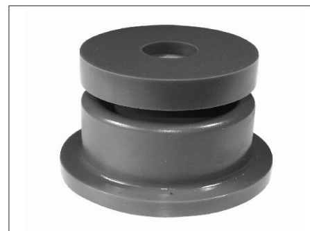
Thick Pad - on top