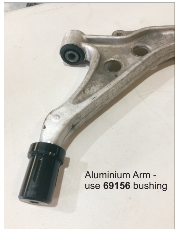
Aluminium Arm - use 69156 bushing

N.B: It is recommended that a licenced workshop or tradesperson carry out the above procedure and that workshop manual and relevant safety procedures are followed in addition to the above.