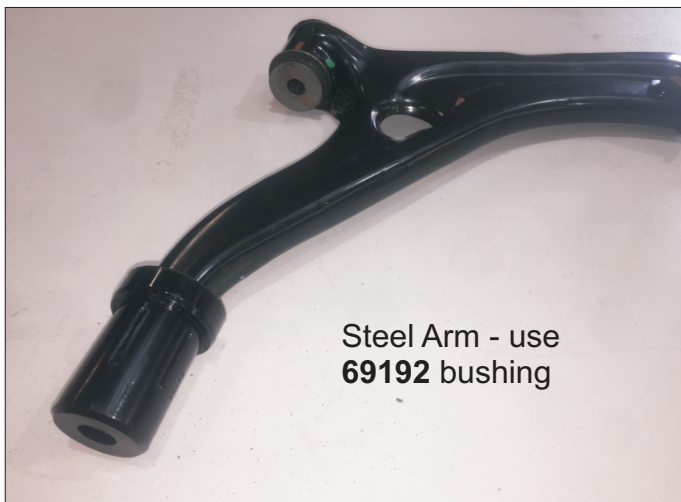
Steel Arm - use 69192 bushing