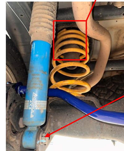
As viewed from the front of the vehicle