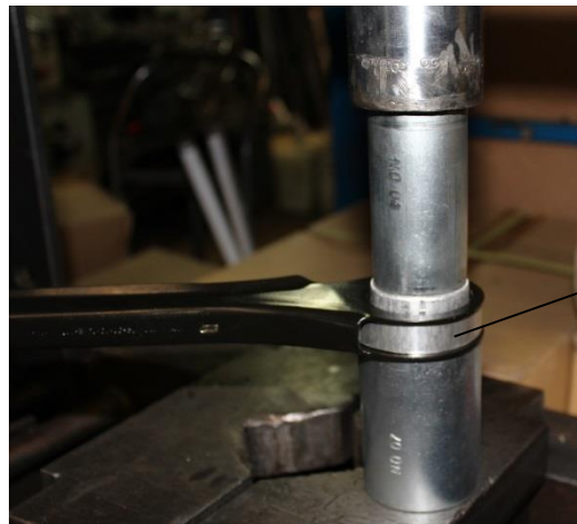
Figure 2: O.E Bush Removal