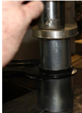
Figure 1: O.E Bush Removal

Note: Polyurethane bushes must be fitted to both sides of the vehicle.