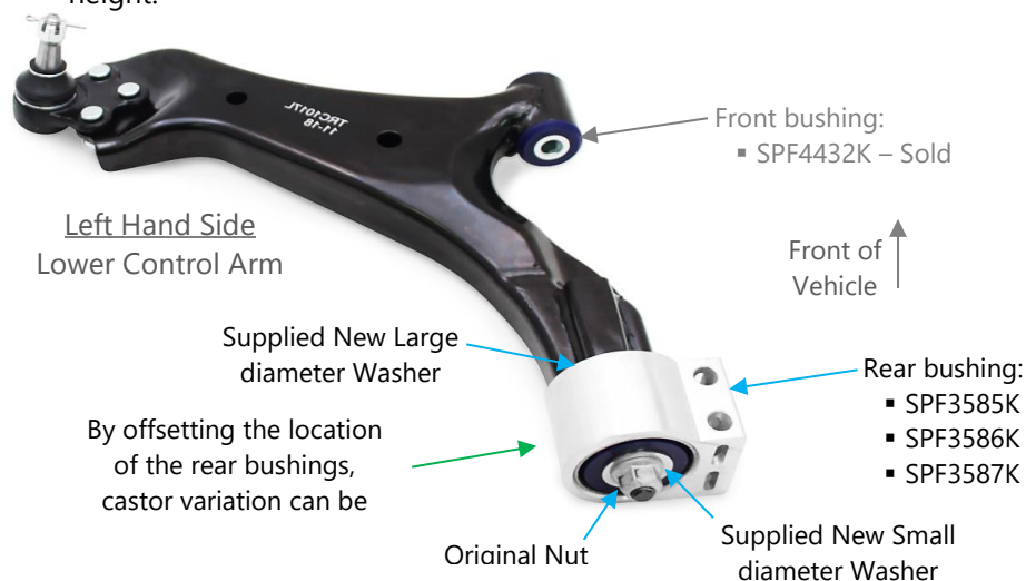
Figure 01 – Left Hand Side Front Lower Control Arm

As viewed from the rear of the control arm, looking forward on rear