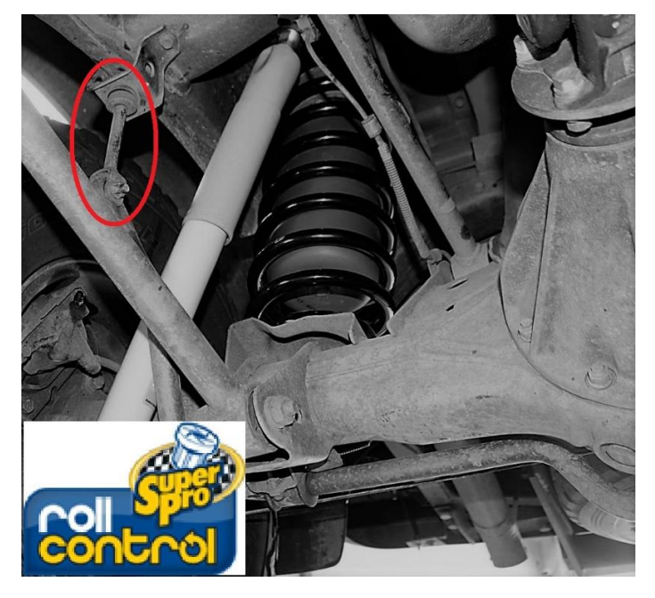
Figure 1 – Rear Sway bar Link Location (RHS Shown).