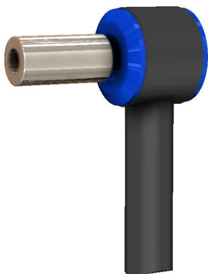
Figure 1: Bush positioning in housing