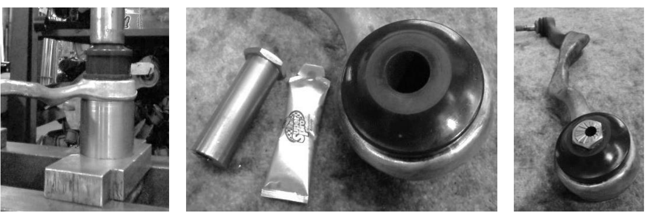
Figure 1: SuperPro Polyurethane Bushes and Crush Tube Assembly in Arm