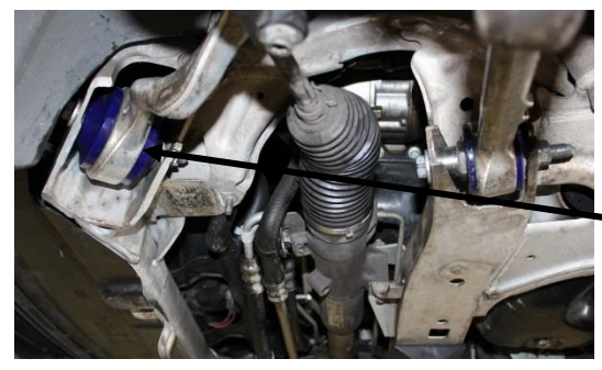
Figure 2: Radius arm assembly in chassis

Hex of the crush tube facing towards the rear of the vehicle