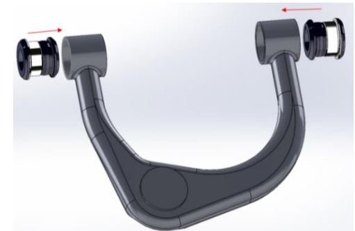
Left Hand Side Shown