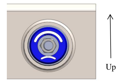
FIG 2 Maintain orientation as shown