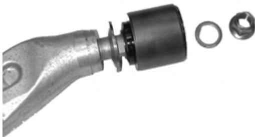
Photo 2 – Kit is assembled onto arm in order: supplied washer, bush (note that protruding section faces front), original “D” washer, and original nut.

Photo 1 – Shown in picture: Left hand side control arm, original nut and “D” washer, offset SPF2026 bush (with crush-tube inserted), supplied washer (flat).