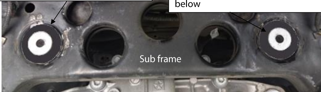
View of installed rear bushes looking from the rear of the vehicle

Note: The black part of the bush should face the rear of the car as below