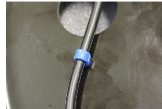
Figure 4 – cable tie tightened around cable

Figure 2 - 4 - outside and inside configuration, feed ABS cable through loop and tighten to hold cable in place, cut excess cable tie