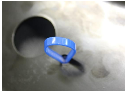
Figure 3 – view from inside of car