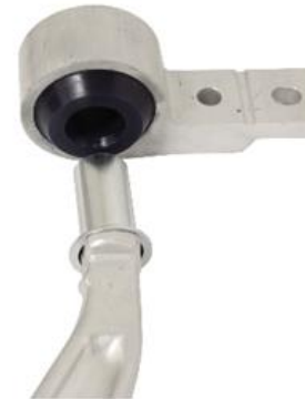
Bushing comes complete with housing