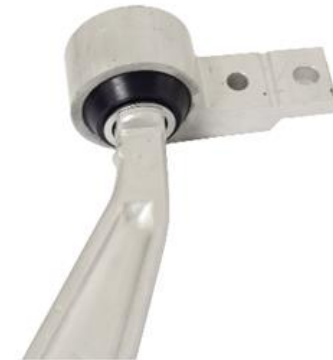
Lubricate bushing assembly and fit to arm

Note: ALOY0002K / ALOY0003K arms must be fitted to both sides of the vehicle.