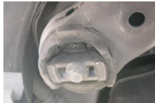
Figure 02 – Cradle Bolts to be loosened.