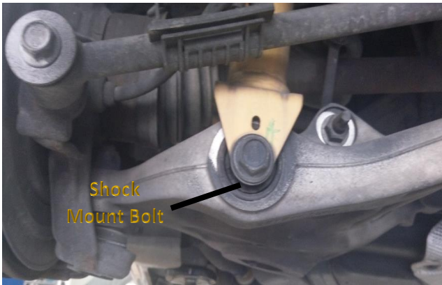
Figure 01 – Left Rear Lower Wishbone Control Arm