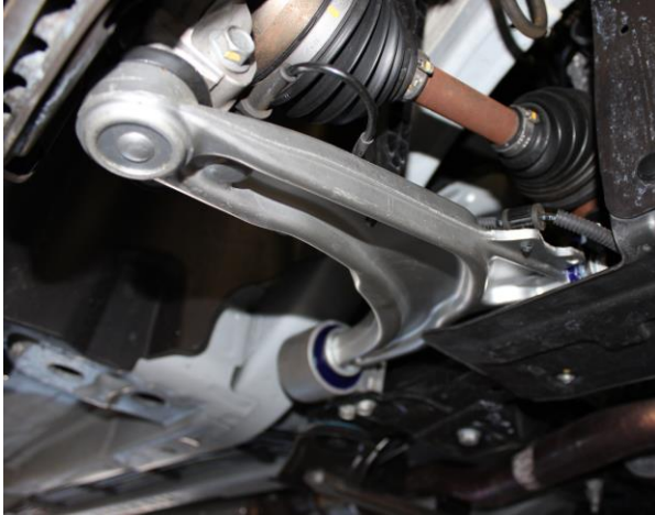
View of underside of car right hand side shown with arm assembly installed

Note: Front Lower Control Arms Kit must be fitted to both sides of the vehicle.