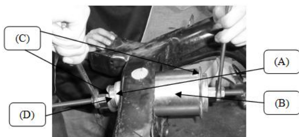
Figure 1: Tools setup for factory bushes removal