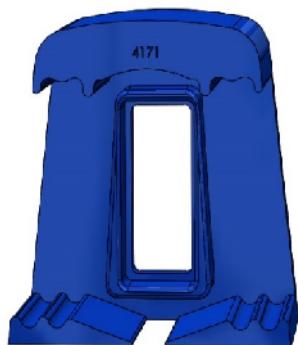
Suits VU Series 2 VZ