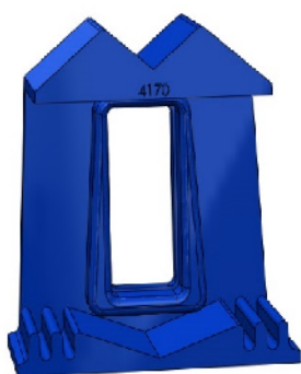
Suits VT-VX VU Series 1