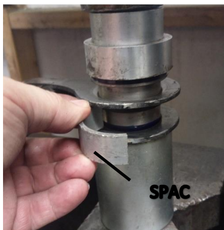
Figure 03 - Spacer utilised in installing SPF4944 Polyurethane