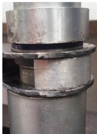
Figure 04 - Pressed SPF4944 Polyurethane Bushing