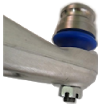
Figure 2: Roll center ball joint assembled in control arm