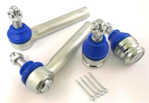
Figure 1: Kit contents