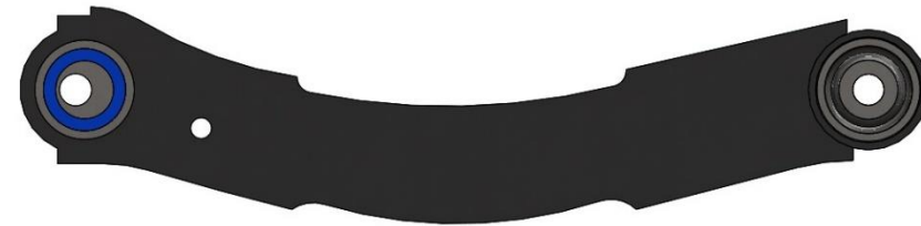
Left Hand Side Rear Upper Control Arm

'Note outer is a hyme joint and should be left in place |