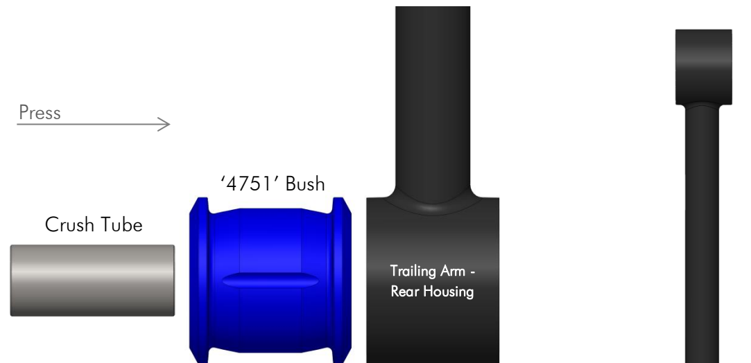
Figure 01 – Trailing Arm Top View Rear Housing

Note: Polyurethane bushings must be fitted to both sides of the vehicle. This kit should be installed by a Qualified Motor Mechanic.