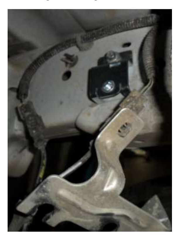
New bracket installed