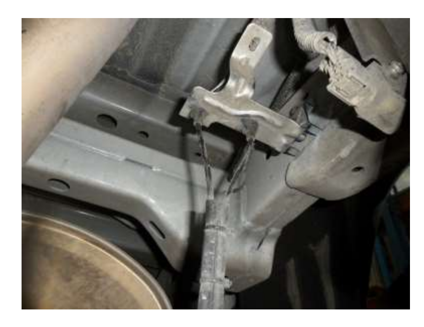
Re fixed bracket and ABS cables re attached