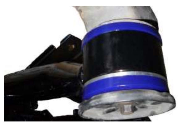
Installed Bushing kit