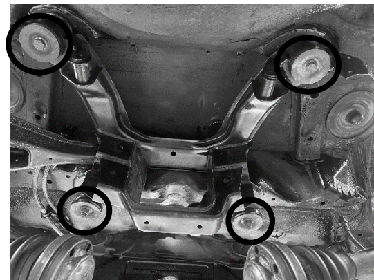
Figure 02 – Rear Subframe