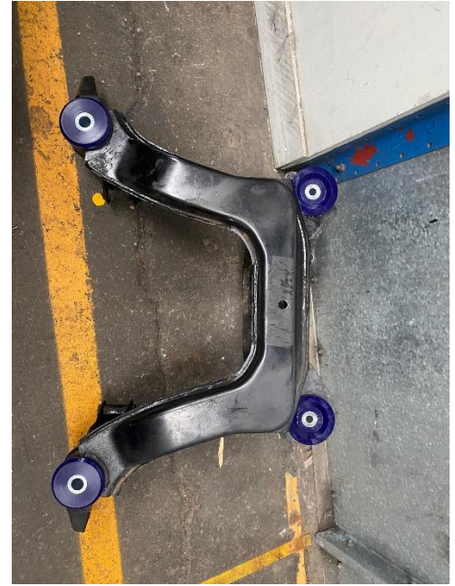
Figure 03 – Rear Subframe with SuperPro Bushings