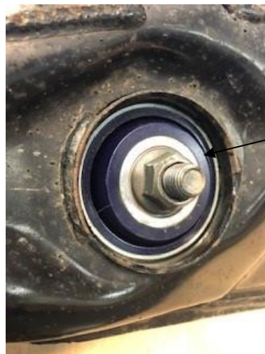
View of installed bush looking from the FRONT of the vehicle