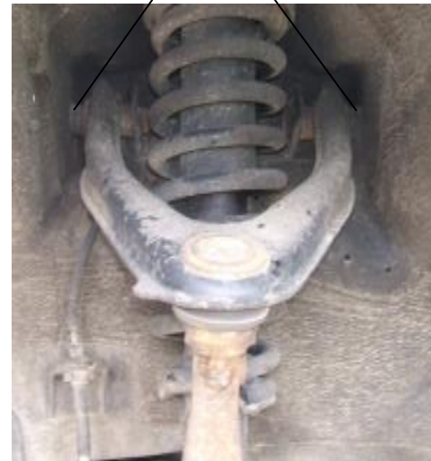
Figure 1: Upper control arm set in vehicle

By adjusting the offset crush tube, camber variation can be achieved.