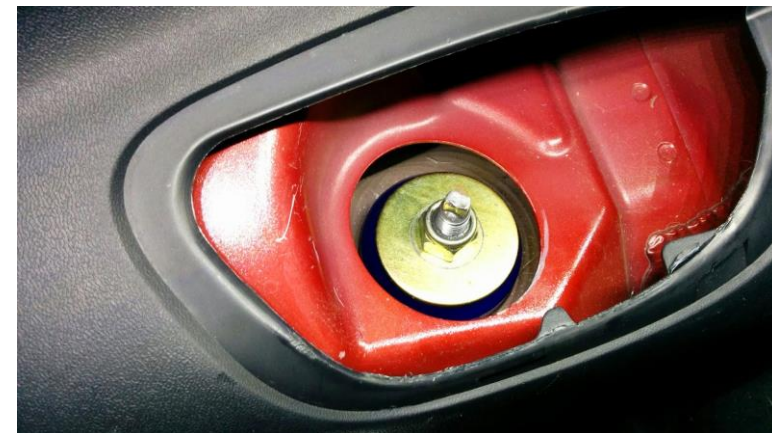
As viewed from the top of the rear shock absorber after fitment