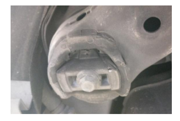
Figure 02 – Cradle Bolts to be loosened.