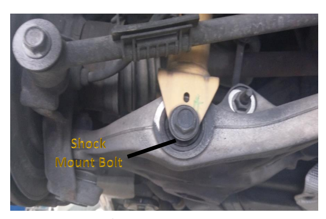
Figure 01 – Left Rear Lower Wishbone Control Arm