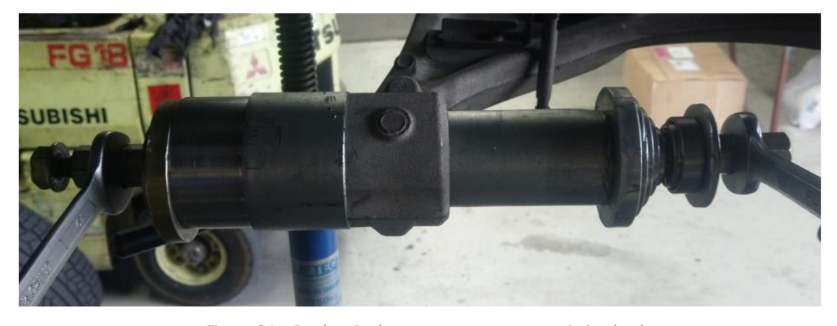
Figure 04 – Booker-Rod set up to remove pre-existing bushes.