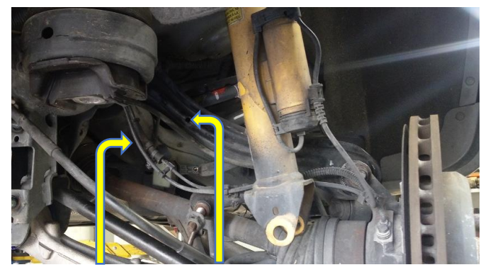
Figure 03– Wiring system to be freed from right rear upper control arm.

• Cut Zip-Ties holding wiring system to rear upper control arm. (See Figure 03/04)