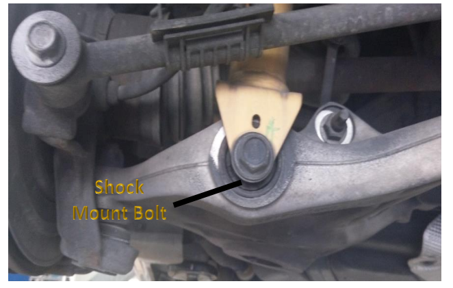
Figure 01-Left Rear Lower Wishbone Control Arm

Place adjustable stand beneath cradle and loosen cradle bolts to allow cradle to drop down. (See Figure 02)