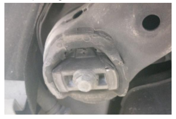
Figure 02 – Cradle Bolts to be loosened.

Place adjustable stand beneath cradle and loosen cradle bolts to allow cradle to drop down. (See Figure 02)