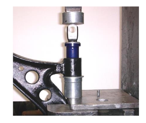
Figure 02 – New bushing installation