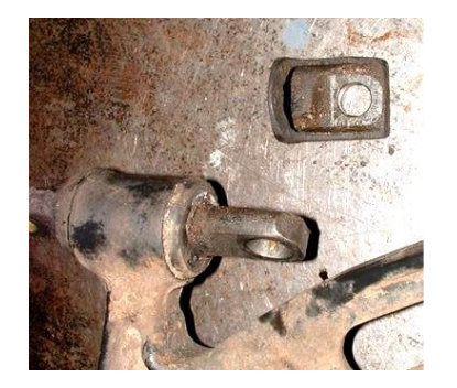
Figure 01 – Original bushing

Following the manufacturer's instructions, remove the front Lower Control Arms from the Vehicle.