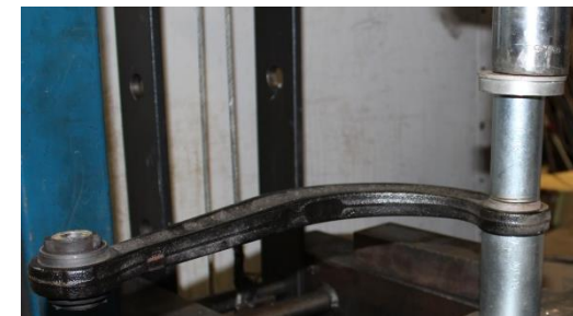
Figure 2: O.E Bush Removal