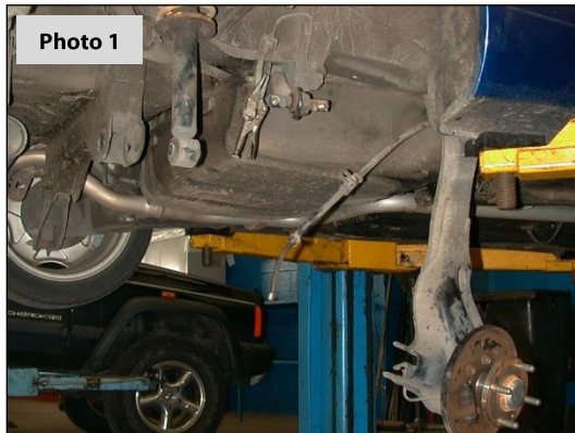
Photo 1 – Jack the vehicle and place on floor stands or rise on a two-post hoist. Remove the wheel and brake drum. Disassemble the brake linings and remove the hand brake cable. Clamp the brake line and remove the brake line from the mounting bracket on the rear of the backing plate. Remove the upper control arm to trailing arm bolt. Remove the radius arm to trailing arm bolts. Remove the trailing arm to lower control arm bolt and let the trailing arm hang free as in photo 1.