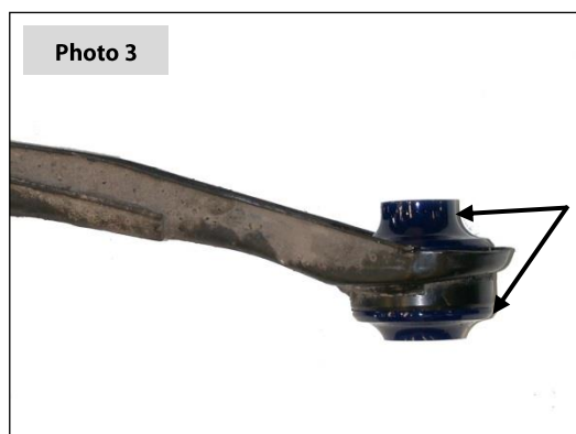
Photo 3 – Press out the old metalastic bush from the front mount of the trailing arm and clean the inner surface of the arm. Apply the grease provided to all mating surfaces of the arm, new bush and steel tube. Only a light coating of this grease is necessary to lubricate the bushes. Press in the new bush, taking note to insert it with the longest offset towards the centre of the vehicle. Insert the steel tube provided.

Assemble in the reverse order of removal and bleed the brake system.