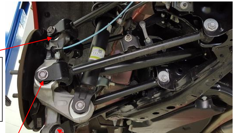
Rear Control Arm Upper-Rear Outer Bush Kit (SPF5550K)