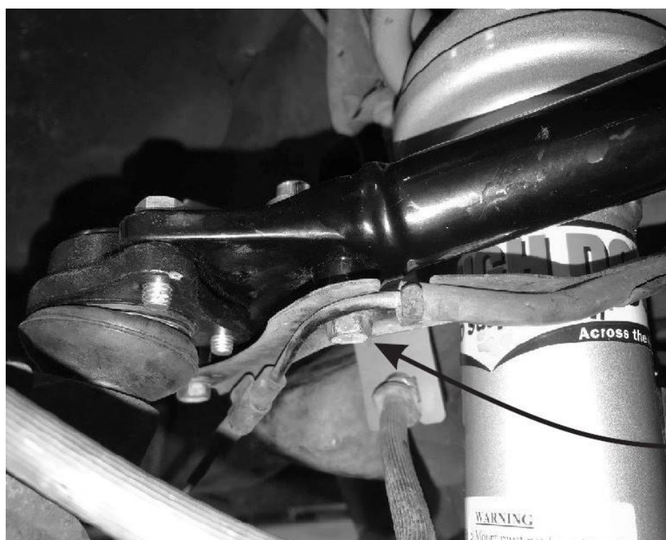
Factory ABS Bracket with Factory Bolts