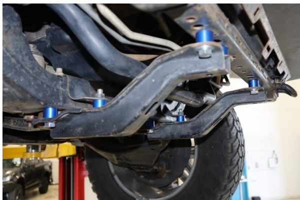
Shows Spacers Installed – view from front of vehicle looking under driver side.

10 x M10 x P1.25 x 45L Bolt; 10 x M10 Spring Washer; 10 x M10 Flat Washer; 10 x 18mm Machined Alloy Spacer.