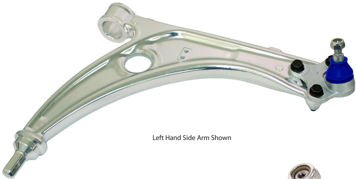
Left Hand Side Arm Shown

To suit both Left-hand drive and Right-hand drive vehicles.