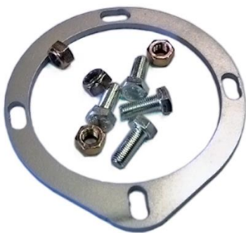
Top plate with bolts

Note the sway bar end attached to the outside of the bracket.