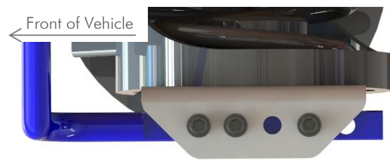
Full Hard Setting